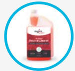
All Surface Cleaner