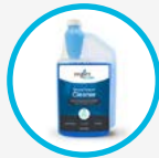
General Purpose Cleaning Solution