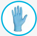
General Purpose Disposable Gloves