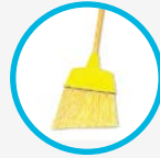
Broom or Cordless Vacuum