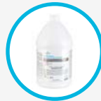
EPA Commercial Disinfectant