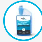
Non-Streaking Glass Cleaner