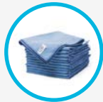
All-purpose Microfiber Towels