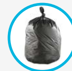
Commercial Trash Can Liners