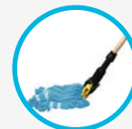
General Purpose Wet Mop