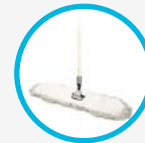
Commercial Dry Dust Mop