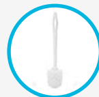
Toilet Brush or Swab