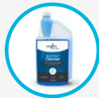
General Purpose Cleaning Solution