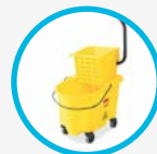
Mop Bucket with Wringer