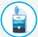
Non-Streaking Glass Cleaner