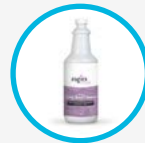
Toilet Bowl Cleaner