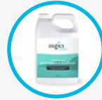
Floor Cleaning Solution