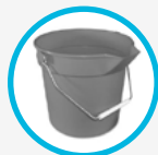
Heavy Duty Cleaning Bucket