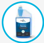
General Purpose Cleaning Solution