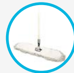
Commercial Dry Dust Mop