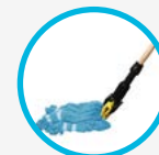
General Purpose Wet Mop