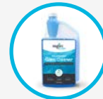
Non-Streaking Glass Cleaner