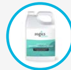
Floor Cleaning Solution