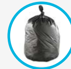
Commercial Trash Can Liners