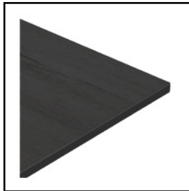
ECORE ATHLETIC Moxie Motivate Plus (Carbone)