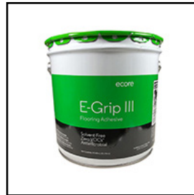
ECORE ATHLETIC E-Grip III Flooring Adhesive

"The big thing is the high-end look of the Moxie product combined with the feel and performance of a gym floor. High-performance fitness flooring doesn't have to be rubber anymore. With Moxie, you get the durability you need while achieving a look that feels memorable, unique, and spa-like —not just another weight room."