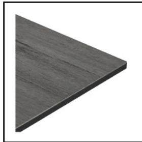
ECORE ATHLETIC Moxie Motivate Plus (Grigio)