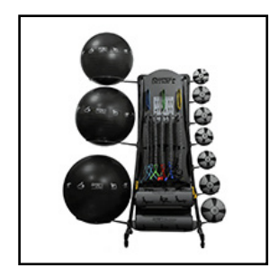
PRISM FITNESS Studio Elite Self-Guided Commercial Package