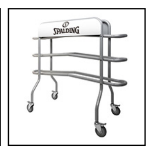
SPALDING ® NBA-Official Ball Rack