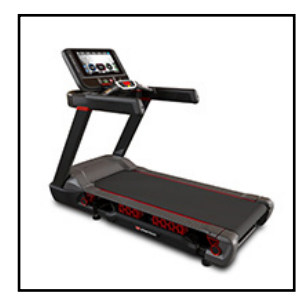
STAR TRAC 10TRX Freerunner<sup>TM</sup> Treadmill