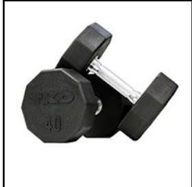
TKO 10-Sided Rubber Dumbbell