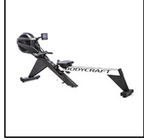
BODYCRAFT VR500 Pro Rowing Machine