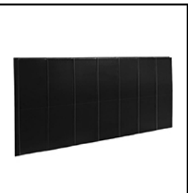
SPALDING ® Wood Backed Safety Wall Pads