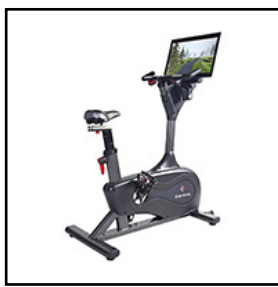
EXPRESSO Go Upright