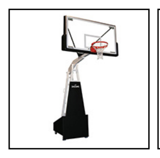
SPALDING ® 2500 Series Arena Style Portable Basketball System