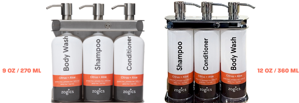
9 OZ / 270 ML