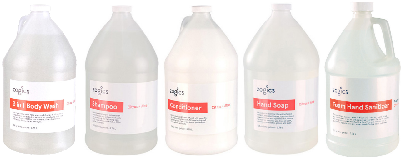
128 FL. OZ / 3.8 L