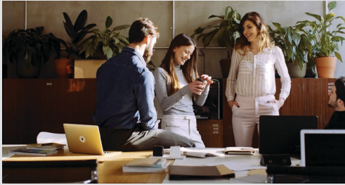
WHAT YOU SEE