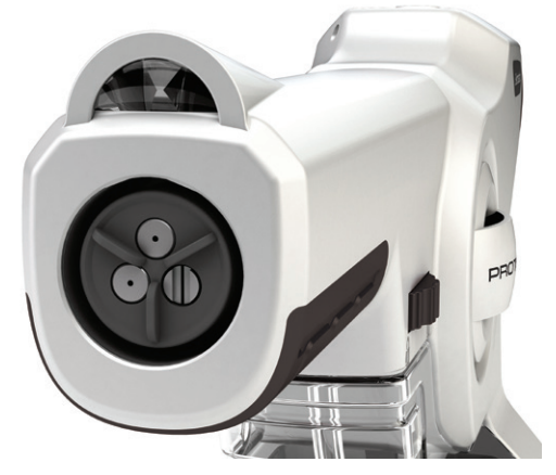
Protexus Three-Tiered Applicator Nozzle

Protextus sprayers revolutionize infection control programs for a wide range of industries including hospitality, education, day care, food service, building management and professional cleaning...among others.